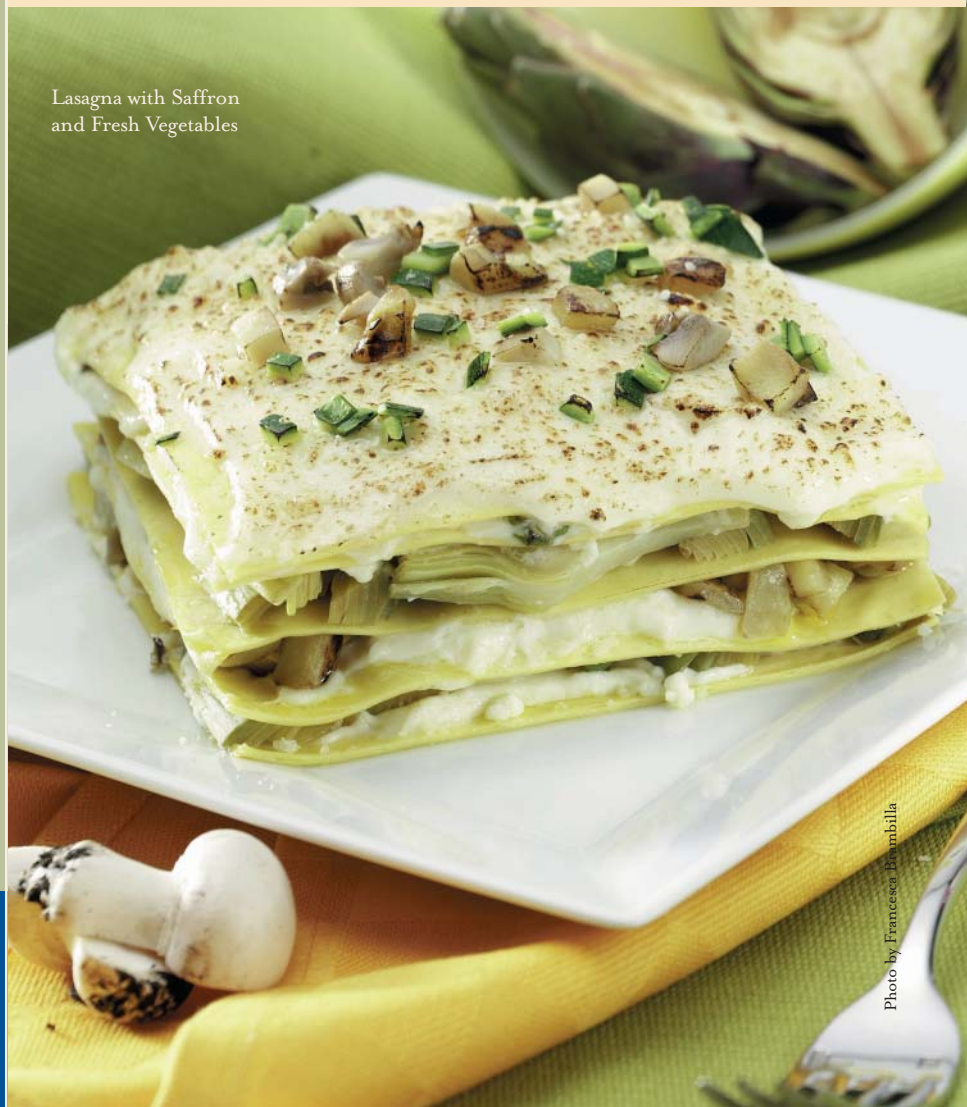
Lasagna with Saffron and Fresh Vegetables

Parma's creamy milk is most famously transformed into one of the city's celebrated foods: nutty, savory Parmigiano Reggiano . It takes about eight quarts of milk to make one pound of this delicacy, the so-called 'king of cheeses.' Its production is limited to the Emilia-Romagna region to ensure authenticity. Aged for a minimum of 24 months, Parmigiano Reggiano is made according to age-old traditions passed down from generation to generation. The cheese is delicious alone, in vegetable-laden soups and salads, and in many pasta preparations, some of which claim a literary pedigree. In The Decameron , Boccaccio speaks of "...mountains of grated Parmigiano, on which people did nothing else but prepare maccheroni and ravioli."