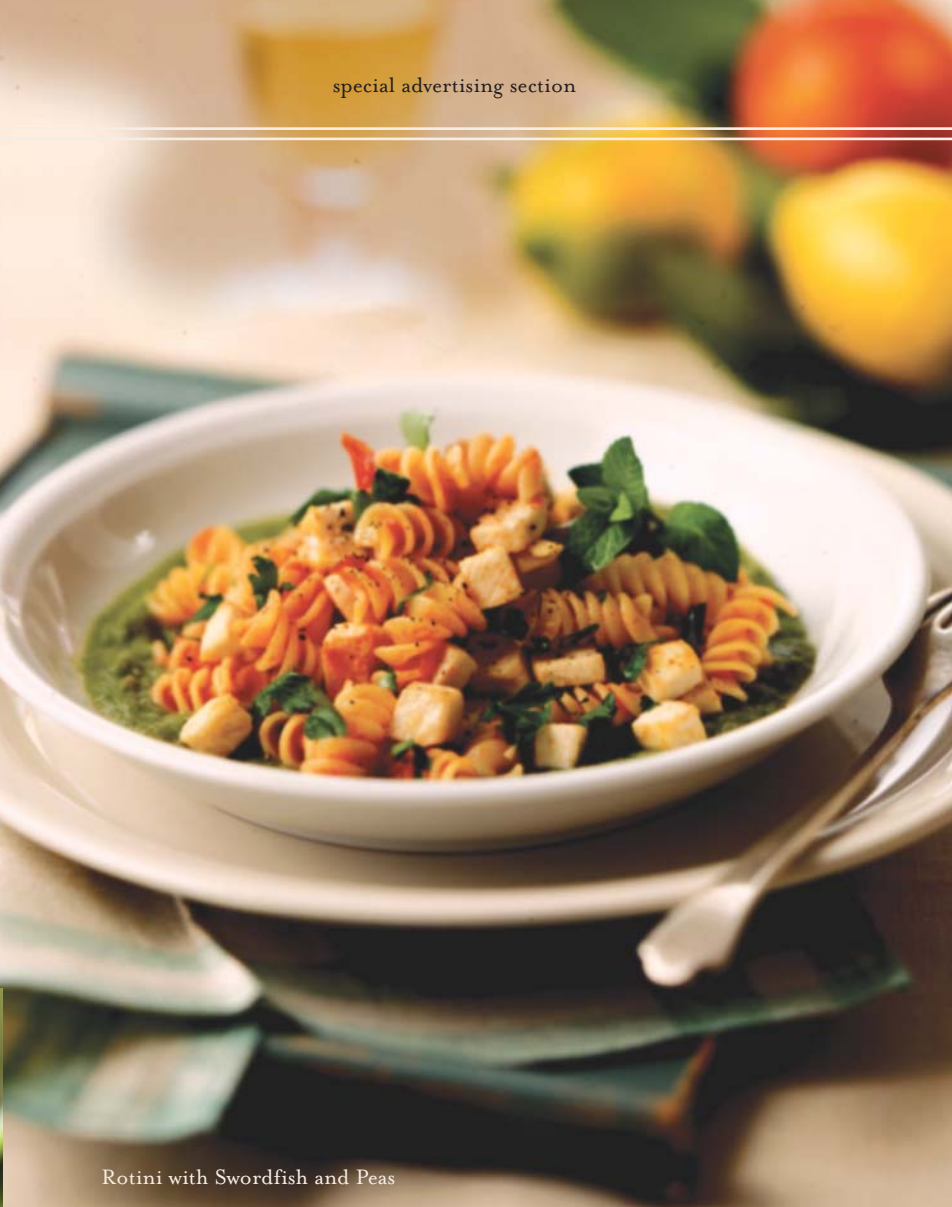
Rotini with Swordfish and Peas