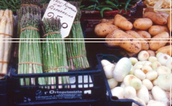
Produce on display at the covered market on Piazza Ghiaia